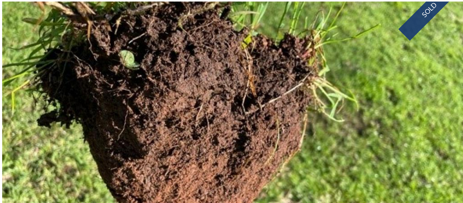
Section, 34 & 36 Crooked Lane, Bool Lagoon