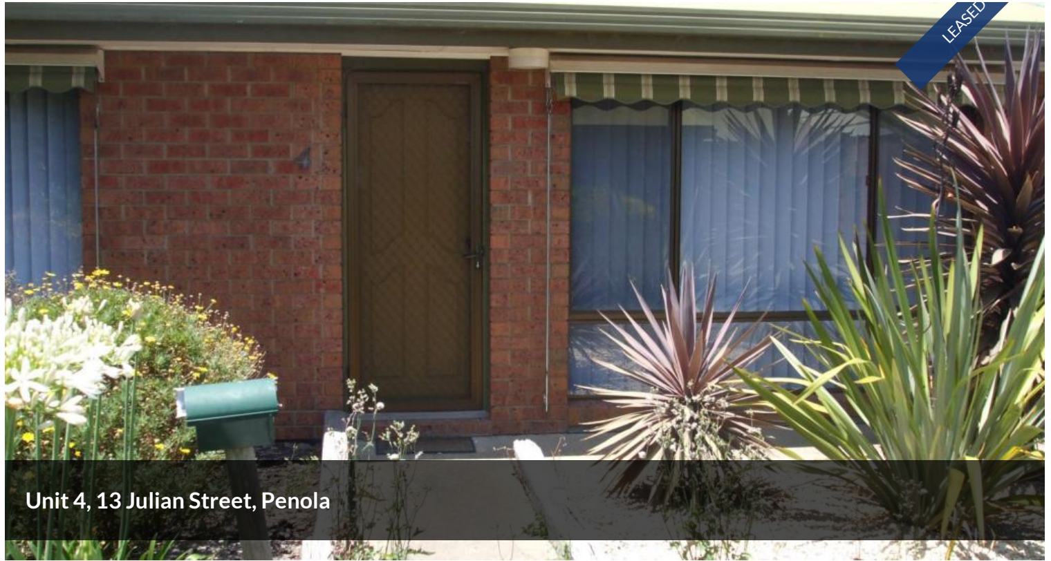
Unit 4, 13 Julian Street, Penola